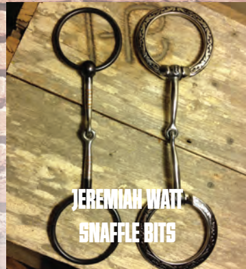
JEREMIAH WATT SNAFFLE BITS