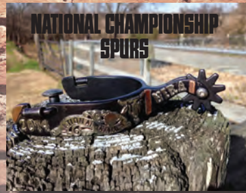
NATIONAL CHAMPIONSHIP SPURS