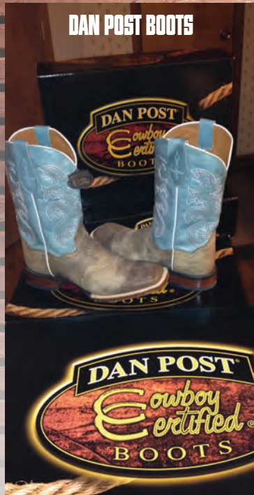
DAN POST BOOTS