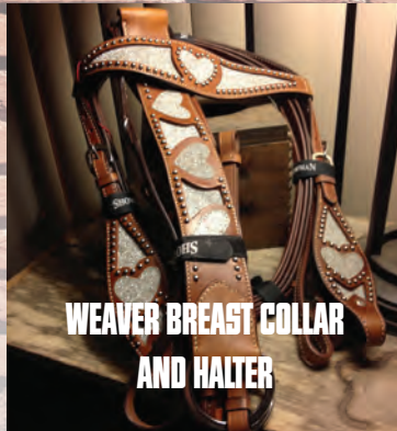
WEAVER BREAST COLLAR AND HALTER